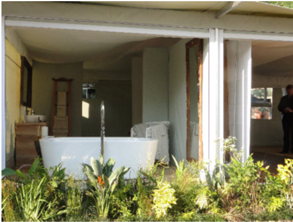
Blinds in the open position

A new development is that we can now provide tents with wireless electrical remote controlled canvas panels (blinds) that can be raised or lowered on demand. The motor and housing is installed at the top of the wall with guide rails on either side. Soft windows can be included in the panels if desired. These panels cannot be installed into all of our standard tent designs without some minor modifications. What makes these panels so different is that one has the capability of opening up the entire tent for a clear 360 view is so desired. It is not required that these panels be included on all sides of a tent. The entire blind is enclosed in a slender metal housing which also includes the AC electrical motor that operates the blinds. Once closed these blinds can also be locked into position.