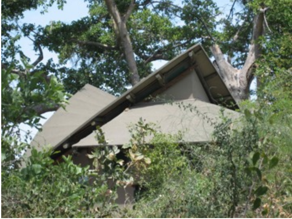
Custom Design Tent