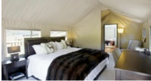
Minaret Tent interior