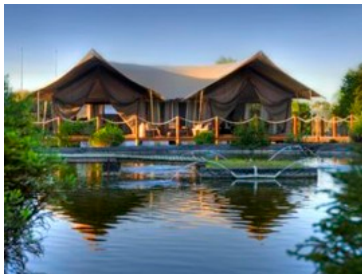
Gomondwane Tent – 68.8 sqm (740 sq ft)