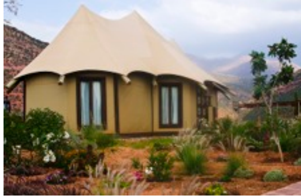
Wood Pole Frame Kambaku Tent