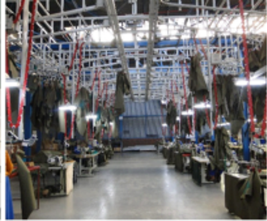
New canvas conveyer system