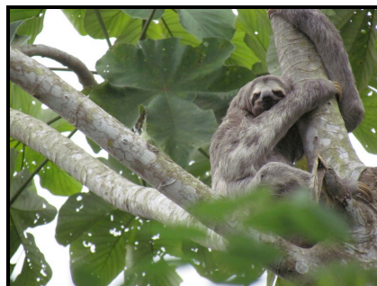
This shy but beautiful sloth was watching (maybe supervising) us during the tent setup

Raul's Canopy Tower is quite famous around the world for its unique setting and exquisite bird watching opportunities, aided by his very professional, loyal and knowledgeable staff. The Canopy Tower Family also includes the Canopy Lodge , Canopy Adventure and Canopy B&B .