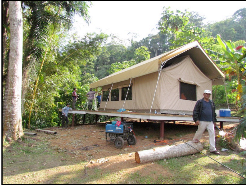
The first tent going up at Canopy Camp in Panama

Canopy Camp is about 4 hours by road from Panama City in the direction of Colombia, the site is truly beautiful with mountain slopes and lazy river with pure fresh water snaking its way through the property. Birds and wildlife abound in the area and the locals are friendly and fun to visit with. The area is safe for visitors and Raul's guides are truly highly knowledgeable and great people.