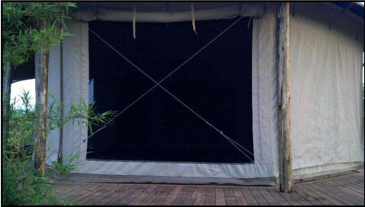
Cross-bracing for wind with steel cables - also illustrating wood poles supporting the tent frame

Though the wood pole uprights give plenty extra rigidity to the frame as mentioned above, we always recommend erring on the side of caution that one does some amount of vertical cross bracing for wind.