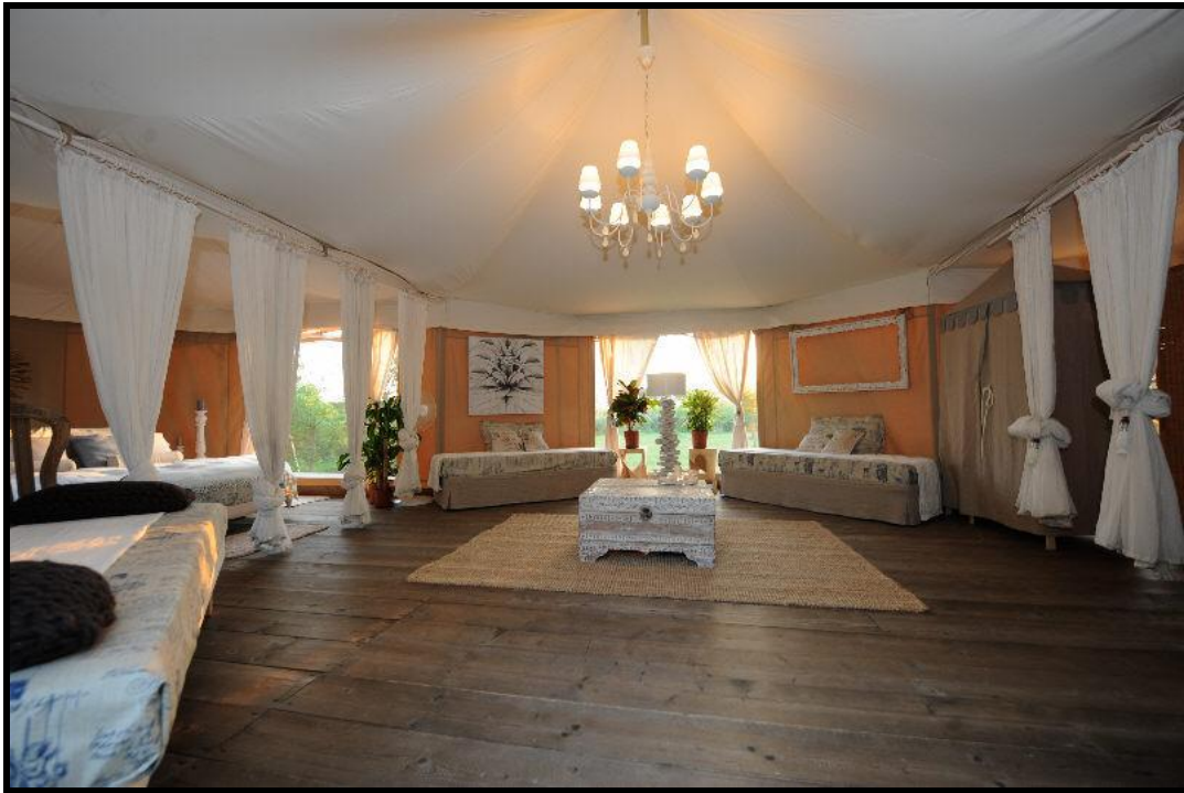
Kambaku at Canonici di San Marco

We are also proud to relate that the Italian Lodge, Canonici di San Marco , has recently added a Kambaku Tent that has received quite a lot of publicity in their local media. The owner, an accomplished attorney in her own right, has offered to assist any new tent owners in the region with their interior design – please contact her via her website if there is any interest from anyone out there.