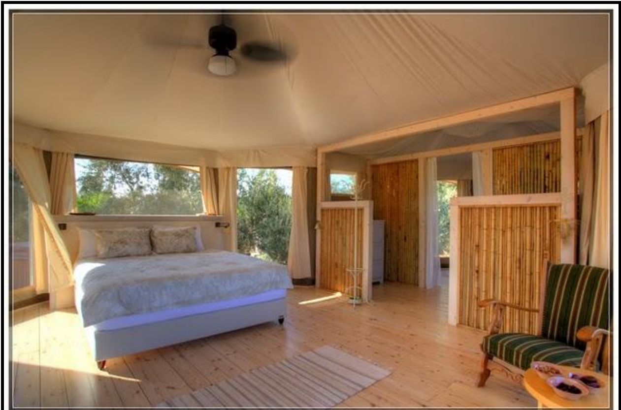
Bububu Tent – Hilla Farm