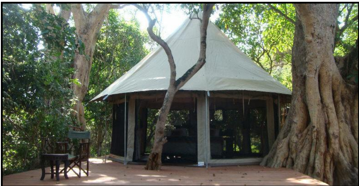
Bateleur Tent showing steel legs supporting the roof frame