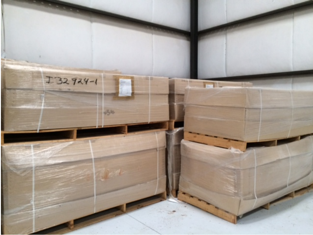
Tents and wood poles in storage in Nevada